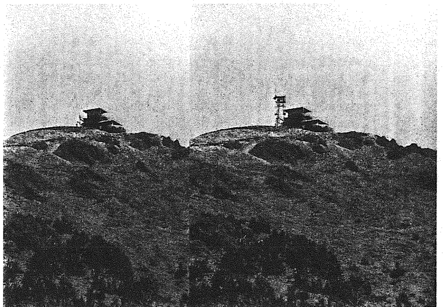
Figure 8 Photo simulation concept for an antenna platform on Mt. Washburn Existing conditions are shown in the left-side image

The equipment and antennas associated with cell phone service atop Bunsen Peak would be relocated to the current Elk Plaza. New infrastructure would be added