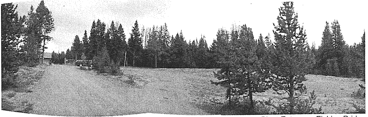
Figure 6 Wastewater Treatment Plant Entrance, Fishing Bridge

A new antenna mounting structure would be constructed at the summit of Mt. Washburn to relocate existing antennas and microwave dishes from the fire lookout structure (Fig. 8). This would address current safety concerns and viewshed impacts from the historic lookout. A new secure equipment building would be placed near this new mounting structure, and would not exceed one story in height (10'-15').